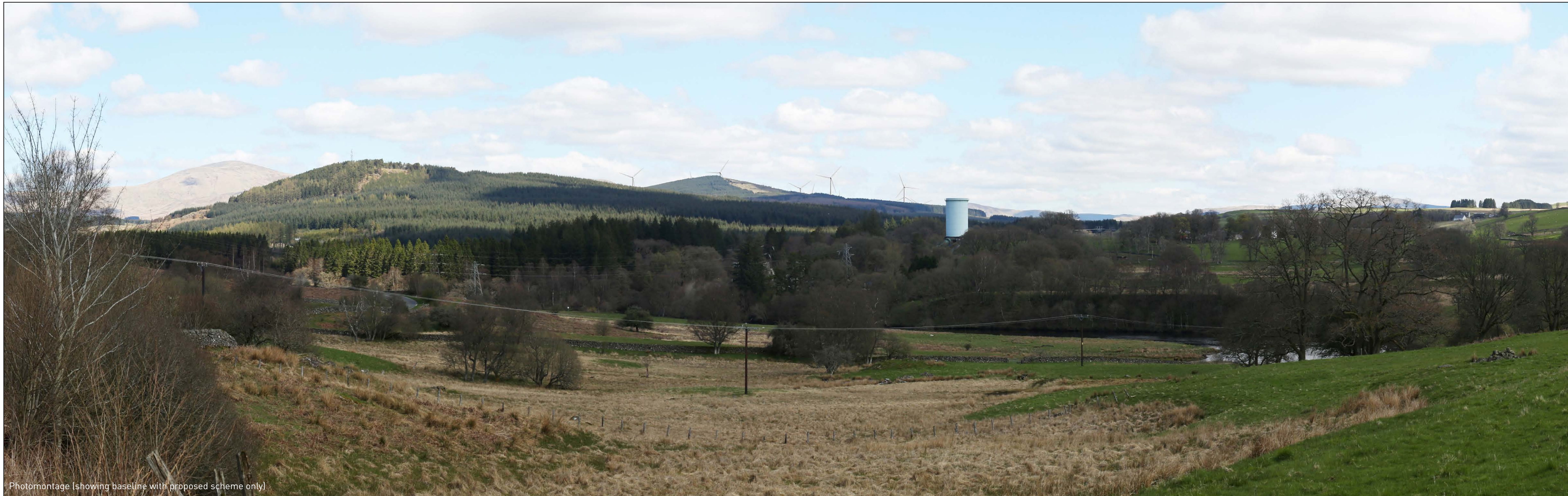
Photomontage (showing baseline with proposed scheme only)